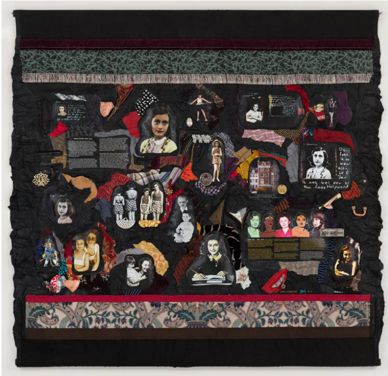
Anne Frank 839 fabric, archival pigment on canvas, leather, metal, zippers 2015 60" x 62" x 2"