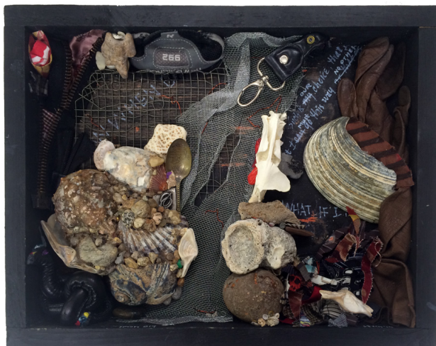
Spoon to Shell 817 spoon, shell and mixed media 2015 11"x 14"x 2"