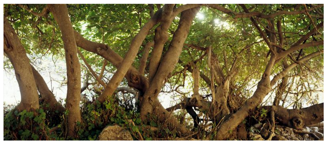
A Tree Finer than All Others

The exhibit opens with several impressive landscapes entitled " My Garden ," "A Tree Finer than All Others," and "Eden, a Dream," which are presented as haunting silk constructions. This sequence is charged with feelings appropriate to the first murmurs of life. In this elusive world of the unknown and uncertain we share with Eve as "She Has Acquired Cunning," and the apprehension of exile and mortality in "Fear Surrounds Them, Shadows Darken." This is uncharted territory, but the presentation of works on silk banners, multi-layer silk constructions and dynamic prints perfectly interact with the subject matter and encompass this very special world of alienation, isolation and germination. Vibrating with nervous excitement, the peopled landscape entitled "Fear & Wonder in the Darkening Gloom" has the enormous capacity to say it all.