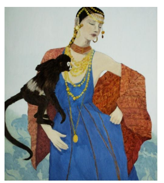
Joan Barber, "Young Woman with Monkey," 2009, Oil on Canvas, 44 x 50 inches

Flomenhaft Gallery is proud to present this exhibition portraying women as revealed differently through the eyes of two amazing artists.