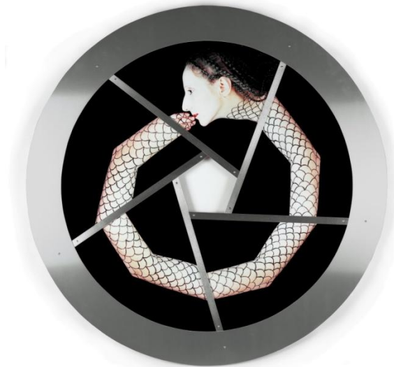
Ouroboros , 2009, C-prints in Aluminum Construction, diam. 45 ¼ inches