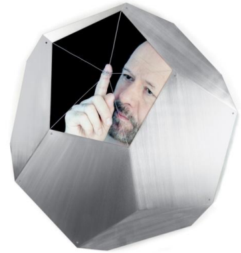
Dodecahedron , 2009, C-print in Aluminum Construction, 37 3/4 x 35 inches

Historically, Rimma and Valeriy are unique and highly regarded artists. They were founding members of the underground conceptual movement in Soviet Russia described in their book Russian Samizdat Art . Since coming to America in 1980, they have had many solo exhibitions in galleries and museums including the Art Institute of Chicago. The New Orleans Museum of Art launched a retrospective of their photography that traveled to fifteen cities. Currently they are included in the Venice Biennale, work submitted by the Moscow Museum of Modern Art. Among other group exhibits that included the Gerlovins were exhibitions at the Guggenheim Museum, The Smithsonian National Museum of American Art, The Bonn Kunsthalle, and The Tokyo Metropolitan Museum of Photography.