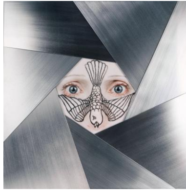
Aperture , 2010, Print in Aluminum Construction, 20 ¼ x 20 ¼ inches