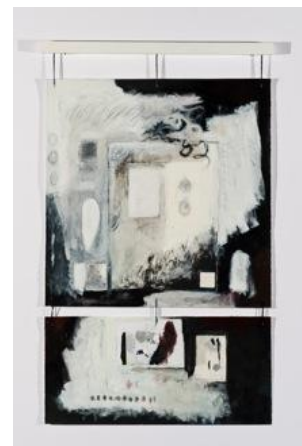
Michael Rider, Untitled; Nicolette , 49" x 30"

Michael Rider's drawings "are inspired by the unconscious mark, the type of line that lingers between writing and drawing." The process he uses is one of creating a number of drawings in different sizes and media, a variety of materials including watercolor, gesso, graphite and charcoal, and layering them together on a larger piece.