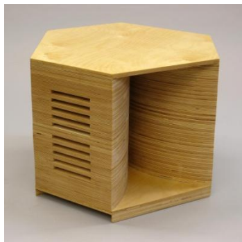
Ardis Graham, The Coffee Table , 23" x 25" x 18"

The works chosen are very diverse; the only criterion was their excellence.