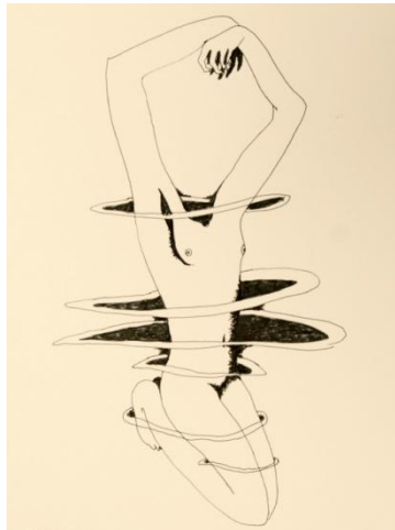
Caroline Erb, Smoke Ring , 8.5" x 11"