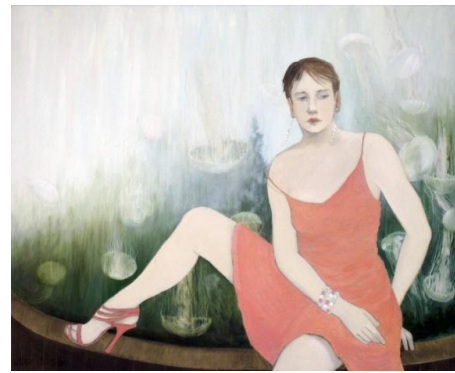
Joan Barber, Captive Sea , 2010, 40 x 50 inches