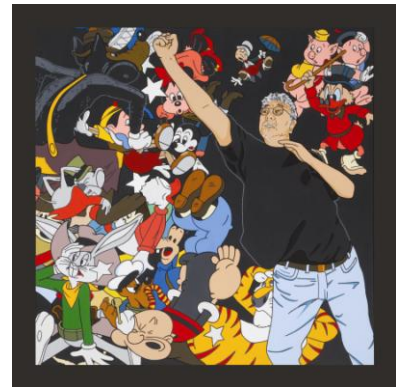
Roger Shimomura, American vs. Disney , 54 x 54 inches