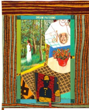
Emma Amos, Dream Patterns , 2009, 43 ½ x 52 inches

We are delighted with the reception our artists have received since their individual exhibits at our gallery, and now comes the time to show off, all at once. This review is separated in two parts so that we can show several of each the artists' works. Part Two will be from April 12 through May 5.