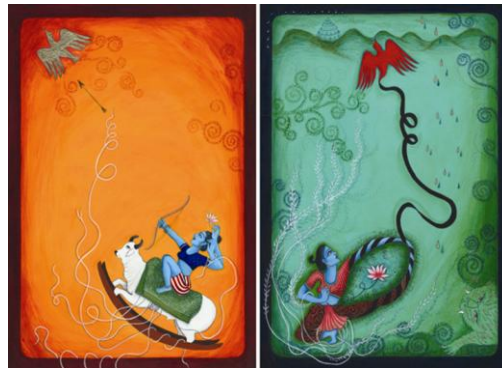
Siona Benjamin, Finding Home 97 and 98: Trap and Release , 2008, 34 x 24 inches (each panel)