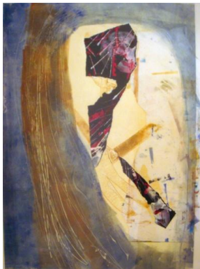
Amy Ernst, A Face in the Crowd , 2010, 30 x 22 inches