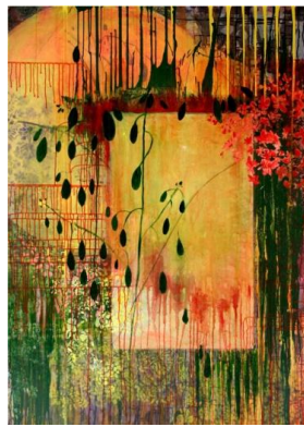
Mira Lehr, Noon Rhapsody , 2007, 72 x 50 inches