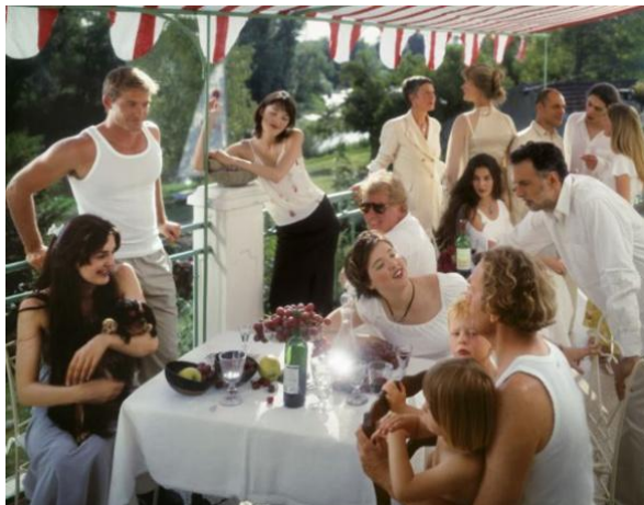
Neil Folberg, After Pierre-Auguste Renoir, The Luncheon of the Boating Party , 2005

Neil Folberg was born in America but moved to Israel in 1979. He studied with Ansel Adams before his exodus. The beauty of his night shot landscapes looking up at the stars all over Israel have been described by critics as ravishing. He captured sites never seen before and we are proud to show several of these amazing works. They were published by Abbeville press in Celestial Nights: Visions of an Ancient Land in 2001 and republished by them in 2008. In this exhibition, we also show other of his Israel landscapes and synagogues from other projects.