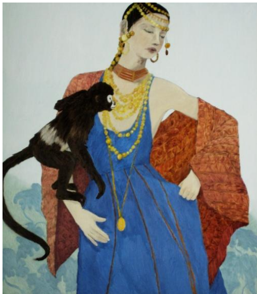
Joan Barber, "Young Woman with Monkey," 2009, Oil on Canvas, 44 x 50 inches

Flomenhaft Gallery is proud to present this exhibition portraying women as revealed differently through the eyes of two amazing artists.