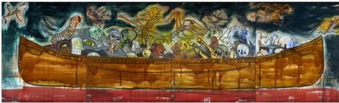
Jaune Quick-to-See Smith, Trade Canoe: Don Quixote in Sumeria , 2005, Oil and Acrylic on Canvas, 60 x 200 in