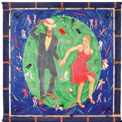
Emma Amos, Let Me Off Uptown , 2000, Oil on Linen Canvas, African Fabric Borders, 80 1/2 x 78 in