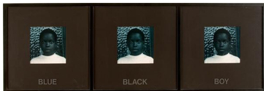
Carrie Mae Weems, Blue Black Boy , 1988, ed 3/3, Monochrome Color Photograph with Silkscreened Text, 17 x 49 in