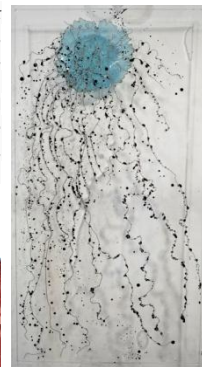
Mira Lehr, Not Quite Social V , 2013, Resin, Ink, Metal Chain, and Japanese Paper on Plexi, 48 x 26 in